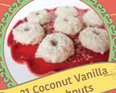
21 Coconut Vanilla Doughnuts

Price: $65 for 6inch; $78 for 8inch; $98 for 10inch. Choose to add Teecino (chicory herbal coffee) for only $6.