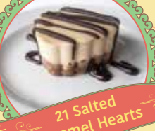
21 Salted Caramel Hearts

Ingredients: Pecans, cashews, dates, tahini, coconut oil, himalayan salt. Comes drizzled with chocolate.