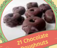
21 Chocolate Doughnuts

Price: $10 for 10 bite size pieces. Choose to add almonds, hazelnuts, mint or orange zest for only $4.