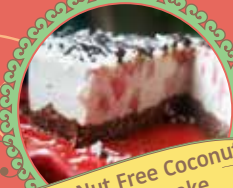
21 Nut Free Coconut Cheesecake

Price: $40 for 4-5 large cupcakes or 10 mini cupcakes.