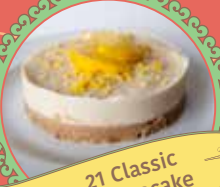
21 Classic Cheesecake

Price: $60 for 3 pieces or you can choose to order 1 for $25.