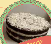
21 Bounty Cake

Price: $55 for 6inch; $70 for 8inch; $85 for 10inch.