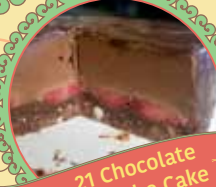
21 Chocolate Ganache Cake

Ingredients: Almond meal, cashews, almond milk, cocoa powder, coconut oil, agave, vanilla.