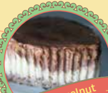
21 Hazelnut Cream Cake

Price: $60 for 6inch; $75 for 8inch; $95 for 10inch.