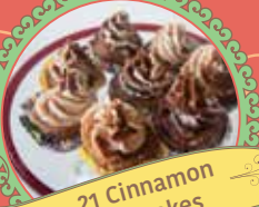
21 Cinnamon Cupcakes

Ingredients: Cashews, pecans, coconut, dates, coconut sugar (optional), coconut oil, agave, vanilla, cinnamon.