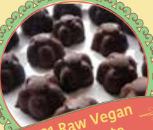
21 Raw Vegan Chocolate

Ingredients: Cocoa powder, coconut oil, agave (or stevia).