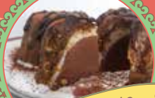
21 Chocolate Almond Cups

Ingredients: Pecans, almonds, cashews, almond milk, dates, coconut oil, cacao powder, orange zest, agave, vanilla.